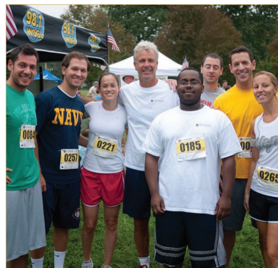
Pond Lehocky team takes time out for a photo as they proudly participate in this year's Travis Manion 9/11 Heroes Run.